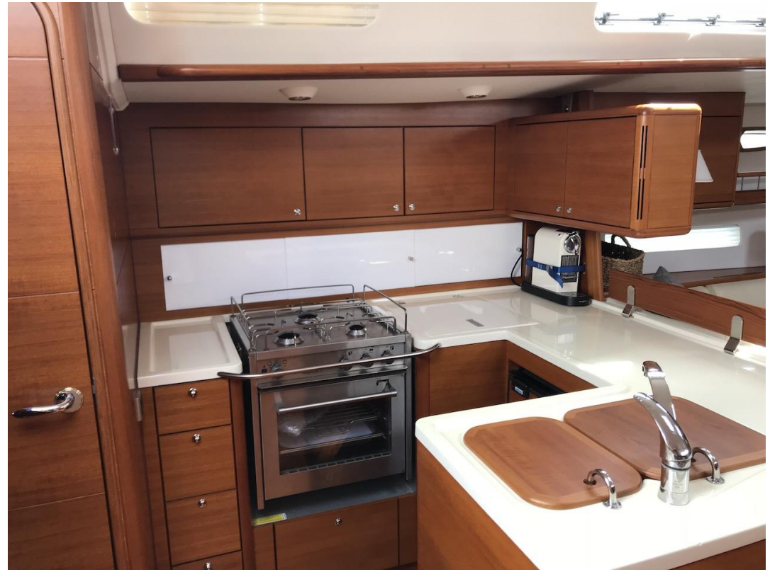
Plaza de San Telmo 5 RCNP / Yacht Center Palma 07012 Palma de Mallorca / Spain www.luxury-marine.com www.solarisyachts.com