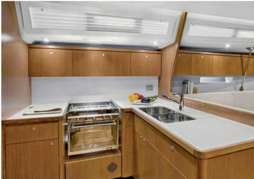
galley image sister ship