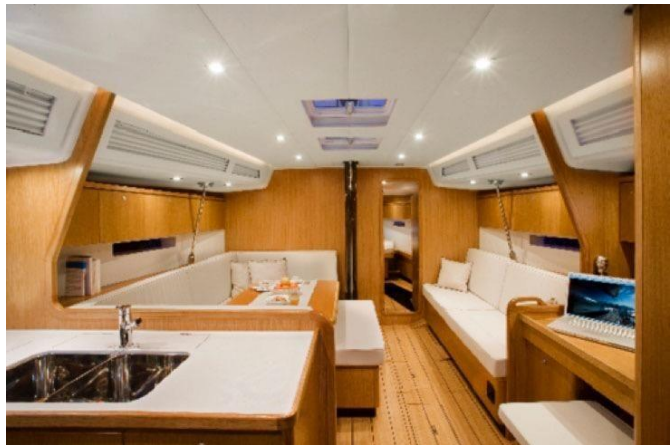
Saloon image sister ship